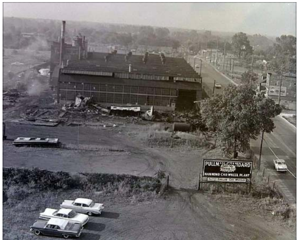
An aerial shot taken in 1961 shows the Pullman Standard Car Wheel plant as it is being readied for demolition. The sign in the lower right-hand corner says "Manufacturers of chilled car wheels". The building fronted Columbia Avenue and Southeastern Avenues.