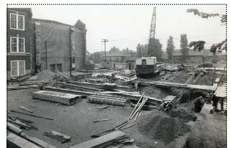
George Rogers Clark High School addition September 10, 1938.

Photos from the Hammond Historical Society Photo Archives