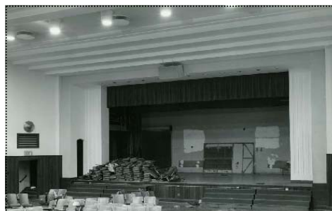
Clark High School auditorium remodeling December 26, 1974 Hutton and Hutton, Architects & Engineers